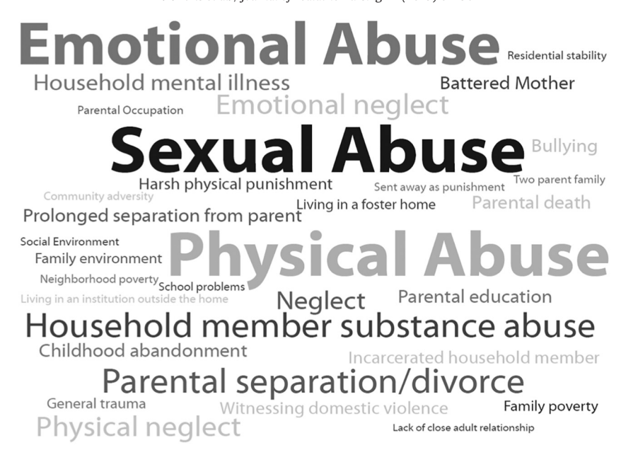
Fig. 1. Types of adverse childhood experiences included in studies. Note: The size of the word reflects its frequency of measurement in studies. The adversity type may have been measured as an individual item, included as part of a summary or score, or both. The shade of the word has no meaning.

study, the highest levels of hazardous drinking were reported by bisexual women with CSA histories compared to heterosexual and lesbian women with CSA histories (Hughes, Szalacha, et al., 2010).